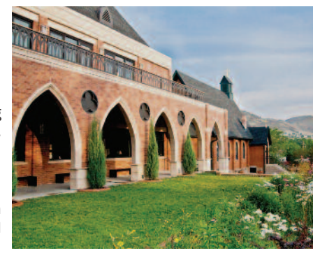
Calvary Episcopal Church

This Gothic Revival style chapel dating to the pioneer days of Golden is the oldest continuously used Episcopal church in Colorado, and is listed on the National Register of Historic Places. Construction began in late 1867 and was completed the following year.