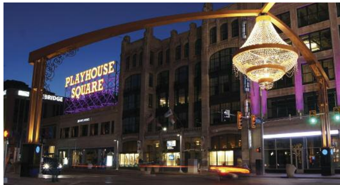
Cover: Euclid Avenue, Cleveland, Ohio. Above, l to r: Society for Savings building, the Soldiers and Sailors Monument, Playhouse Square.