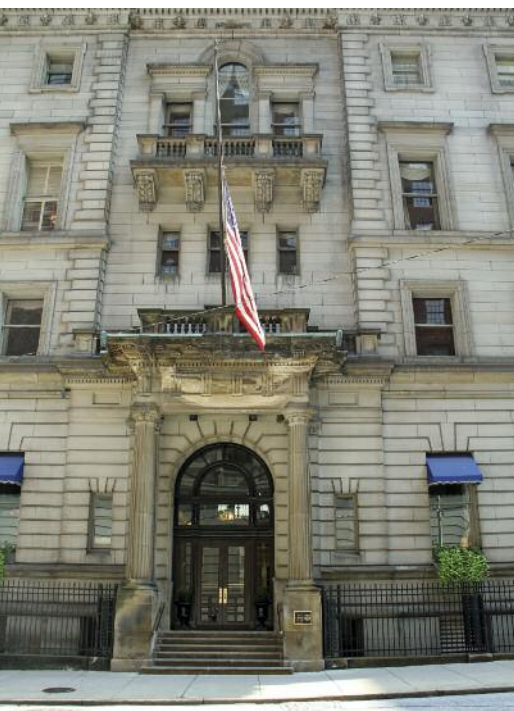
Below, l to r: Union Club, Cleveland. Kirtland Temple. The gardens at the Hay-McKinney Mansion. West Side Market. Severance Hall.