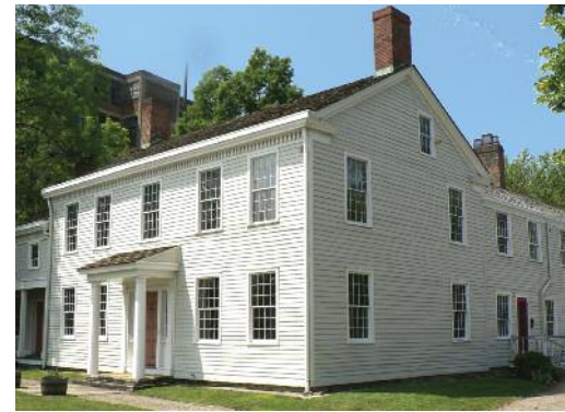
Above, l to r: Lawnfield, the home of President James A. Garfield. Harcourt Manor interior. Dunham Tavern.

Bus departs at 9 a.m. Breakfast on your own Lunch at Skye Bistro (included) Bus returns to hotel by 4:30 p.m. Dinner on your own